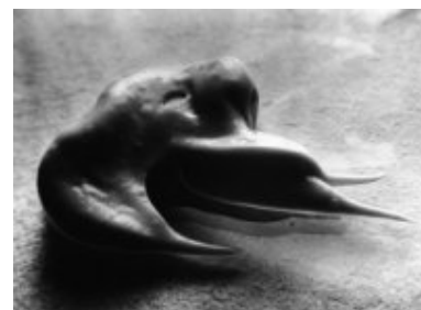
© Salvador Dalí, Fundació Gala-Salvador Dalí, VEGAP, Figueres, 2019