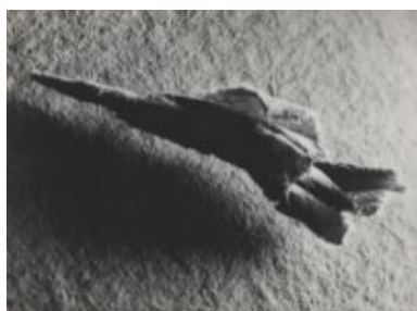
© Salvador Dalí, Fundació Gala-Salvador Dalí, VEGAP, Figueres, 2019 Brassai © Estate Brassai-RMN-Grand Palais