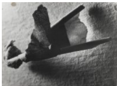
© Salvador Dalí, Fundació Gala-Salvador Dalí, VEGAP, Figueres, 2019 Brassai © Estate Brassai-RMN-Grand Palais