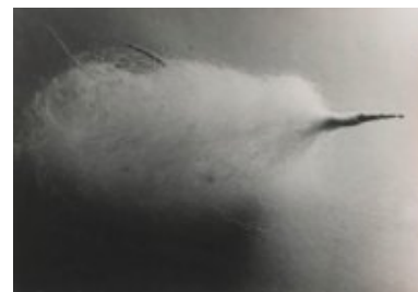
© Salvador Dalí, Fundació Gala-Salvador Dalí, VEGAP, Figueres, 2019 Brassai © Estate Brassai-RMN-Grand Palais