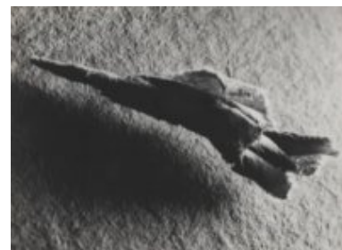
© Salvador Dalí, Fundació Gala-Salvador Dalí, VEGAP, Figueres, 2019 Brassai © Estate Brassai-RMN-Grand Palais