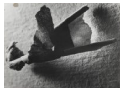
© Salvador Dalí, Fundació Gala-Salvador Dalí, VEGAP, Figueres, 2019 Brassai © Estate Brassai-RMN-Grand Palais