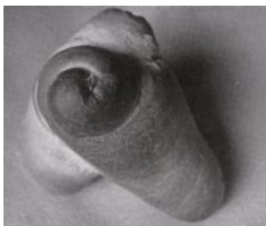
© Salvador Dalí, Fundació Gala-Salvador Dalí, VEGAP, Figueres, 2019 © Estate Brassai Succession