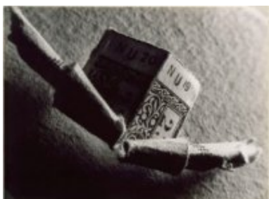
© Salvador Dalí, Fundació Gala-Salvador Dalí, VEGAP, Figueres, 2019