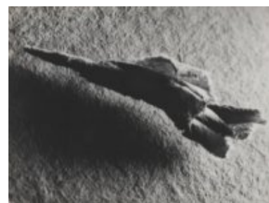
© Salvador Dalí, Fundació Gala-Salvador Dalí, VEGAP, Figueres, 2019 Brassàï © Estate Brassàï-RMN-Grand Palais