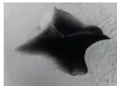
© Salvador Dalí, Fundació Gala-Salvador Dalí, VEGAP, Figueres, 2019 Brassai © Estate Brassai-RMN-Grand Palais