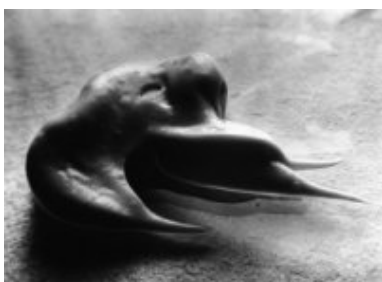
© Salvador Dalí, Fundació Gala-Salvador Dalí, VEGAP, Figueres, 2019 © Estate Brassai Succession - Philippe Ribeyrolles