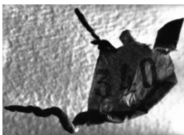
© Salvador Dalí, Fundació Gala-Salvador Dalí, VEGAP, Figueres, 2019