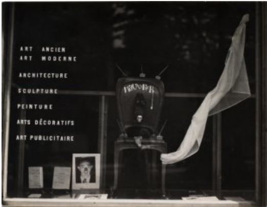
© Salvador Dalí, Fundació Gala-Salvador Dalí, VEGAP, Figueres, 2019 © Man Ray Trust, VEGAP, Girona, 2019