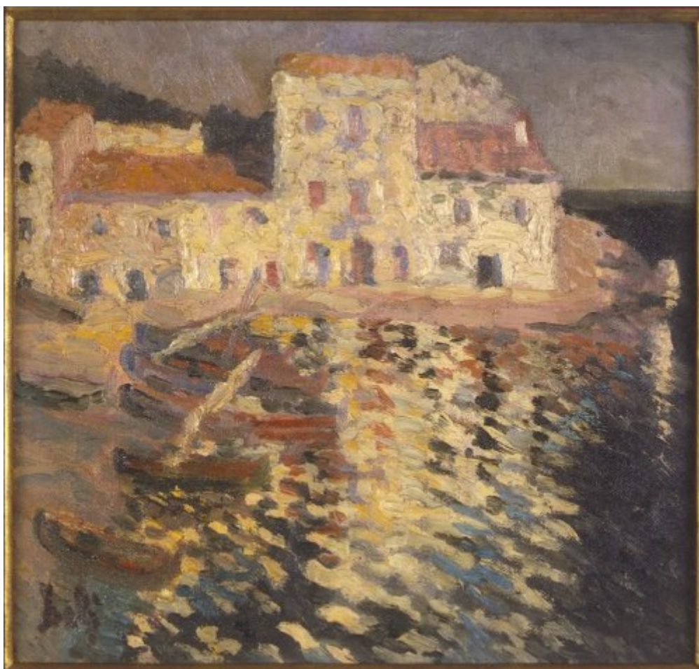
© Salvador Dalí, Fundació Gala-Salvador Dalí, Figueres, 2004