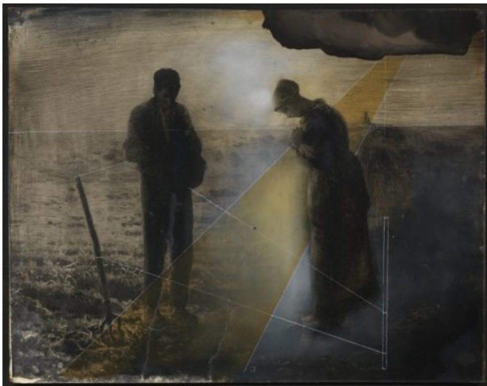
© Salvador Dalí, Fundació Gala-Salvador Dalí, Figueres, 2017