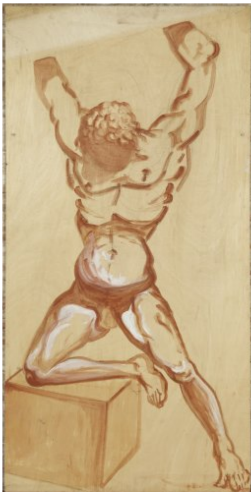
© Salvador Dalí, Fundació Gala-Salvador Dalí, Figueres, 2017