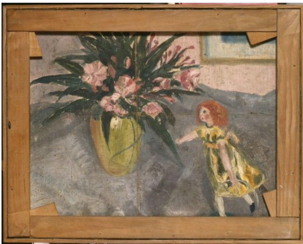
© Salvador Dalí, Fundació Gala-Salvador Dalí, Figueres, 2007